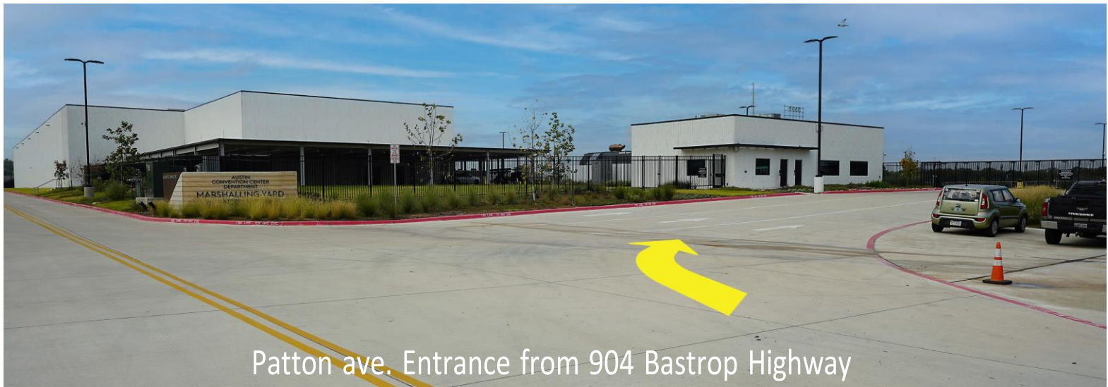
Patton ave. Entrance from 904 Bastrop Highway